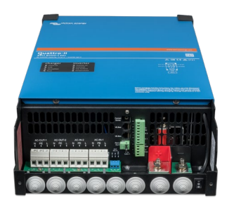
Connection Area Ouattro-II 48/5k

Operational data can be stored and displayed on our VRM (Victron Remote Management) website, free of charge. When connected to the internet, systems can be accessed remotely, and settings can be changed.