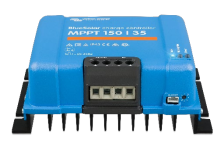
Solar Charge Controller MPPT 150/35