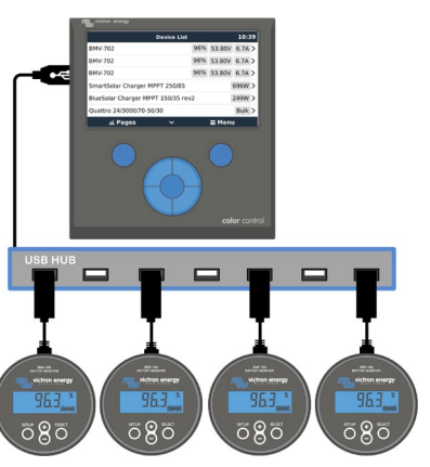
A maximum of four BMVs can be connected directly to a Color Control GX. Even more BMVs can be connected to a USB Hub for central monitoring